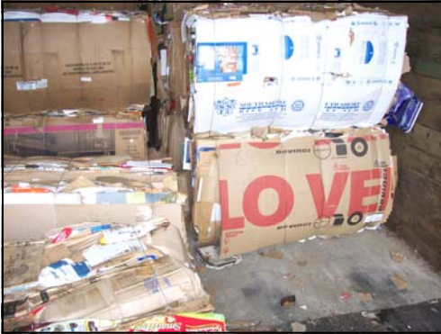
Great Photo Op at the Mission Recycling Depot! These bails of recycled papers are waiting to be picked up to be processed into new products, and while they wait, they tell an important message.